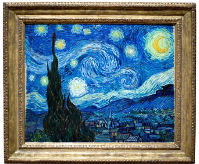
Van Gogh's famous "The Starry Night" painting

In the last few years of his life, he painted hundreds of pictures. Many of these became his best work. He was obsessed with his art. Some days, he would barely eat. He never got married or had children, and became the stereotypical "crazy and intense artist." One night, he had an argument with his friend Paul Gauguin. Right after that, he cut off part of his ear lobe in a fit of passion. He's seen wearing a bandage over his ear in some of his self-portraits.